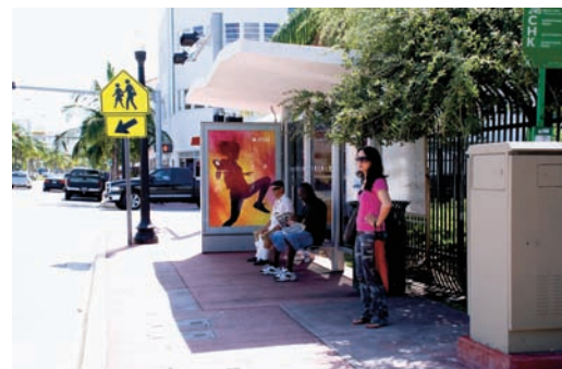
Passengers wait to board a Miami-Dade Transit bus in Miami Beach, Fla.

driving around downtown Miami, and then you come back to Miami Beach, suddenly you’re back among two-, three-, four-story buildings. The trees are standing higher than the buildings. There is lots of light, lots of big sky. That’s when you begin to appreciate the value of historic preservation to create livable communities,” Cary said. □