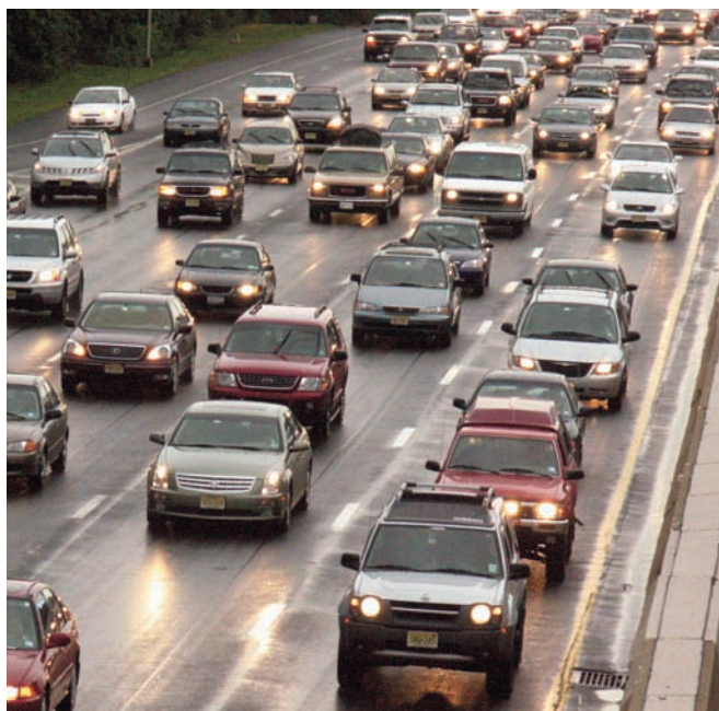
Transportation accounts for roughly one-quarter of carbon dioxide emissions in the U.S.

As the search for concrete strategies and proven tactics continues—almost all climate change legislation sets targets without necessarily specifying methods for achieving them—many in the transportation sector see the need for a threefold approach: improving fuel economy, lowering the carbon content of fuels and decreasing aggregate vehicle miles traveled. These