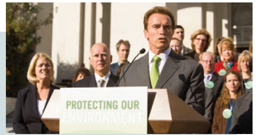
California Gov. Arnold Schwarzenegger discusses AB 32, a state law that mandates greenhouse gas emission standards stricter than the federal government's.

There are also no fewer than six regional multi-state pacts, such as that of the Western Governors' Association, which spans 16 states west of the Mississippi, and the Regional Greenhouse Gas initiative, which extends from Maryland to Maine. Some states have even embarked on their own independent foreign policy initiatives through international greenhouse gas accords